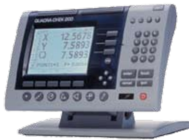
Quadra-Chek 200 Readout