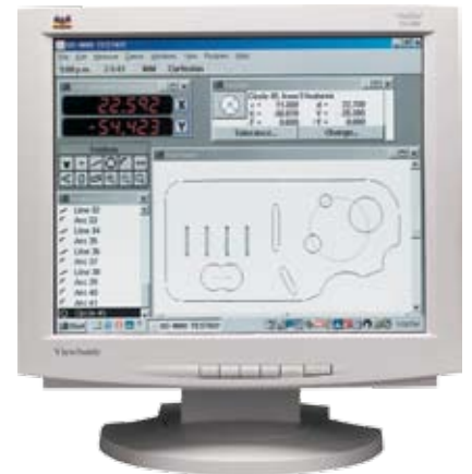
Quadra-Chek 5200 Measurement System