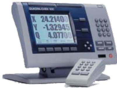
Quadra-Chek 100 Readout

Their design reflects a deep understanding of user needs, with an intuitive user interface and simple, meaningful visual displays; innovations that improve operator productivity, reduce errors and save time and money. The powerful, familiar architecture of Quadra-Chek digital readouts empowers operators during every stage of the measurement process.