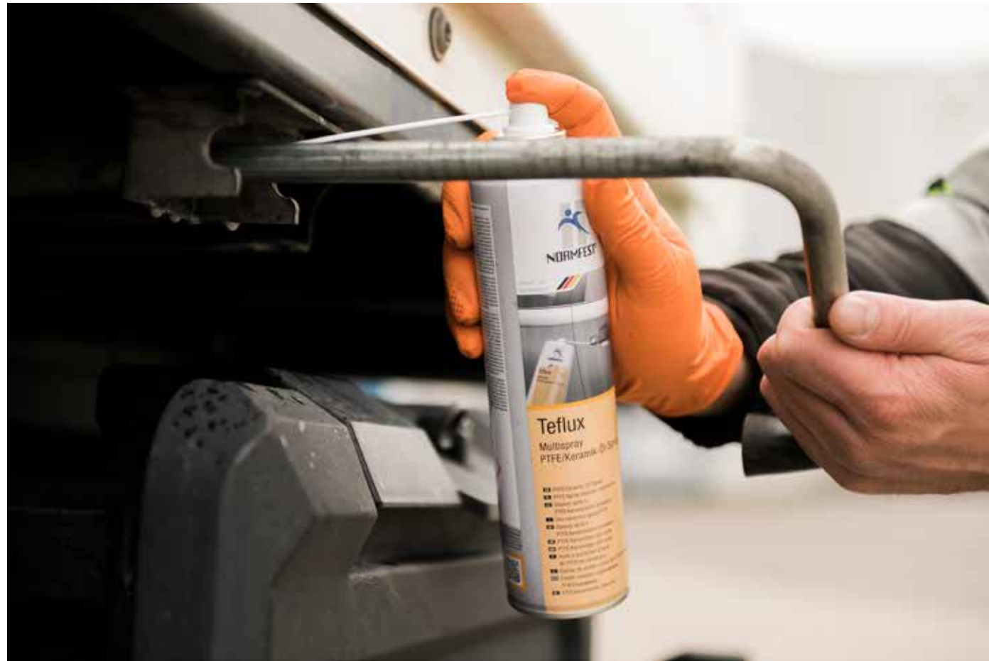
01 „Inspection and Maintenance“ starter set 6 pieces