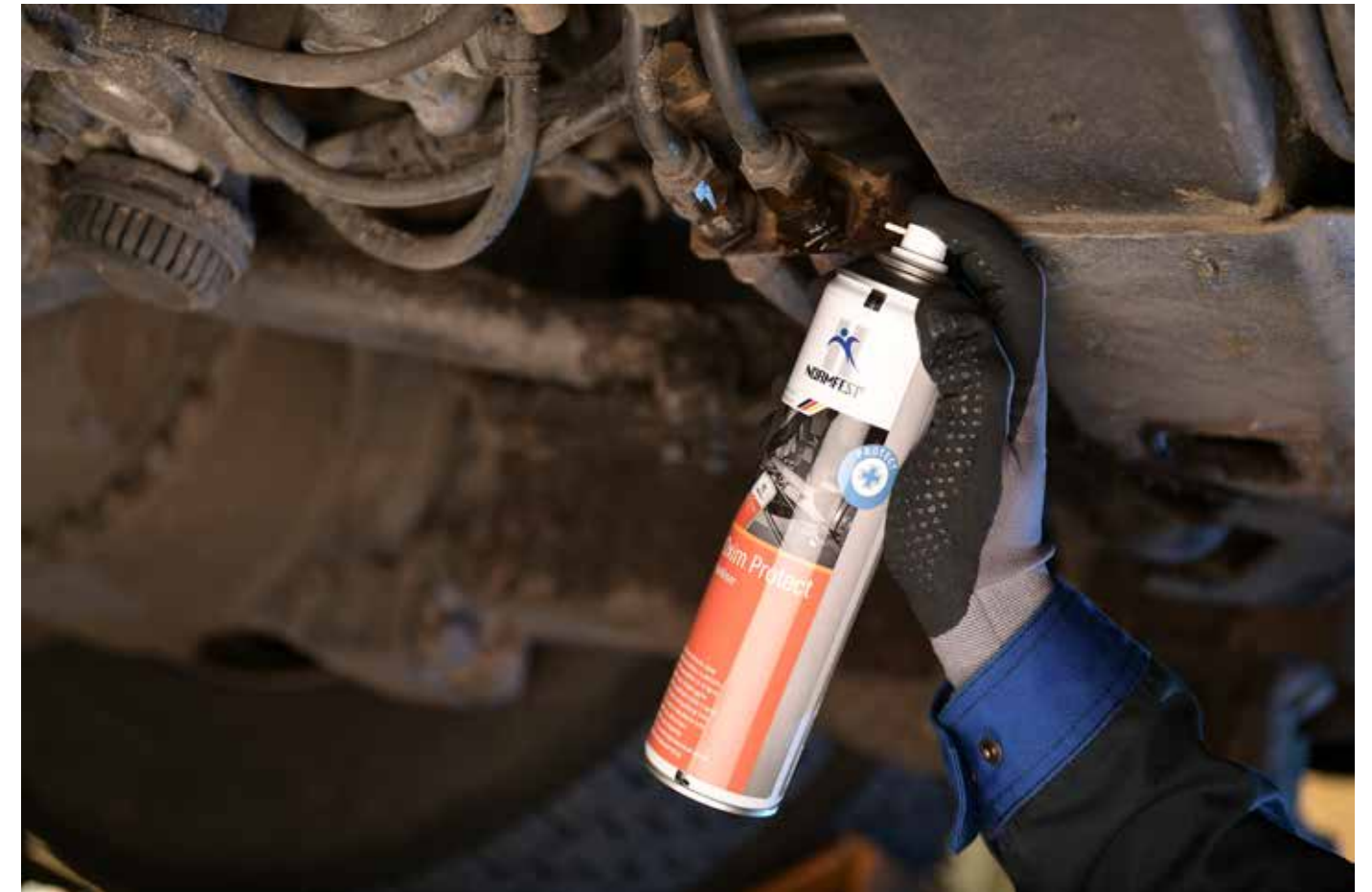
02 „Protect“ starter set 6 parts